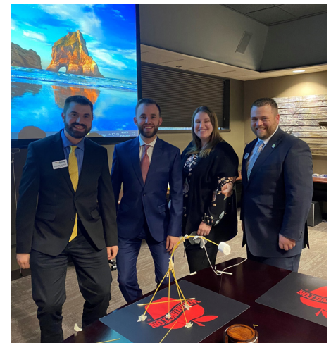
Wenatchee: The winning group of the Marshmallow Challenge, with the tallest, still standing, tower!