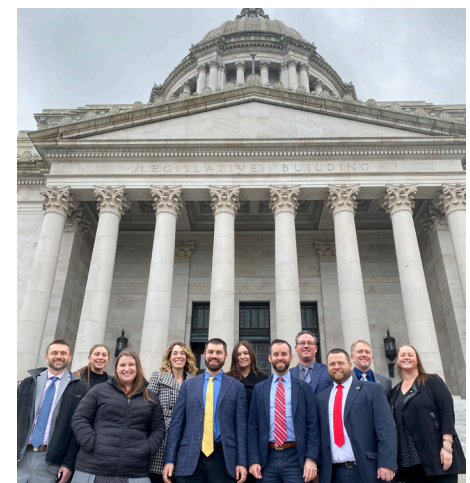
Olympia: Class 43 after a tour of the Legislative Building.