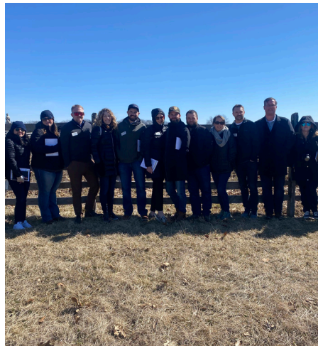
Gettysburg: Class members spend a full day touring Gettysburg with a leadership lens through the eyes of military experts.