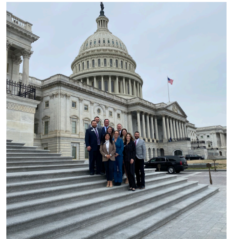
D.C.: Class 43 on the steps of the capitol, prior to meeting Congresswoman Cathy McMorris Rodgers