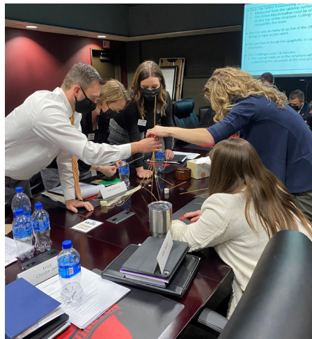
Wenatchee: Class members participate in a group dynamics competition with their newly assigned public policy groups, made up of different communication styles.