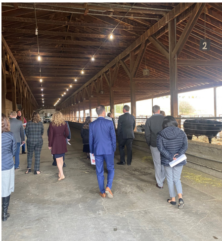
Pullman: Class 43 tours the Cattle Feeding facility at Washington State University.