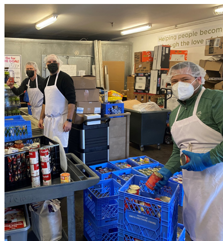
Tacoma: Class members volunteer at a shelter lunch service, and sort donations.